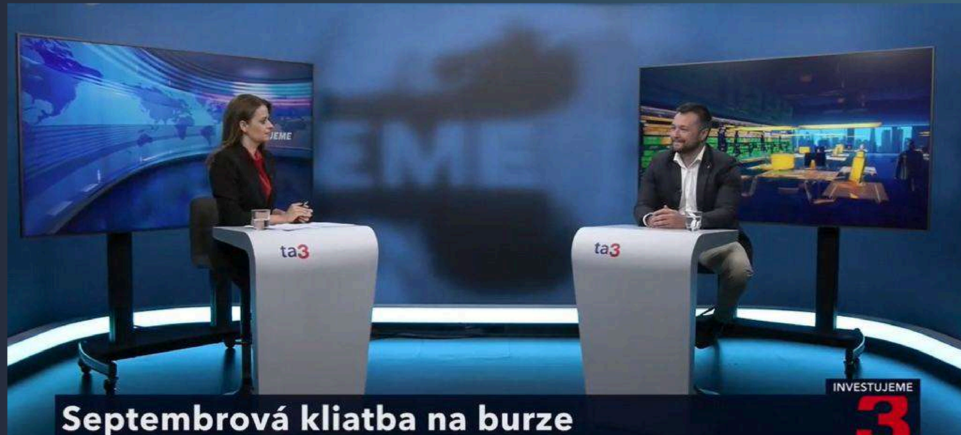
Septembrová kliatba na burze

You could see the show on September 23, 2025, in a repeat case, and if you missed it by chance, you can watch it on the link: https://www.ta3.com/relacia/1012911/septembrova-kliatba-na-burze